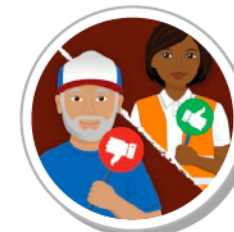
Dealing with Conflict