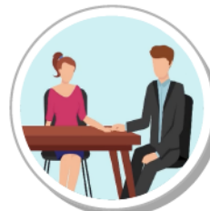
Building a Thriving Romantic Relationship

Option: Allow them to earn points and badges for completing non-mandatory training. Build in recognition for drivers that go above and beyond.